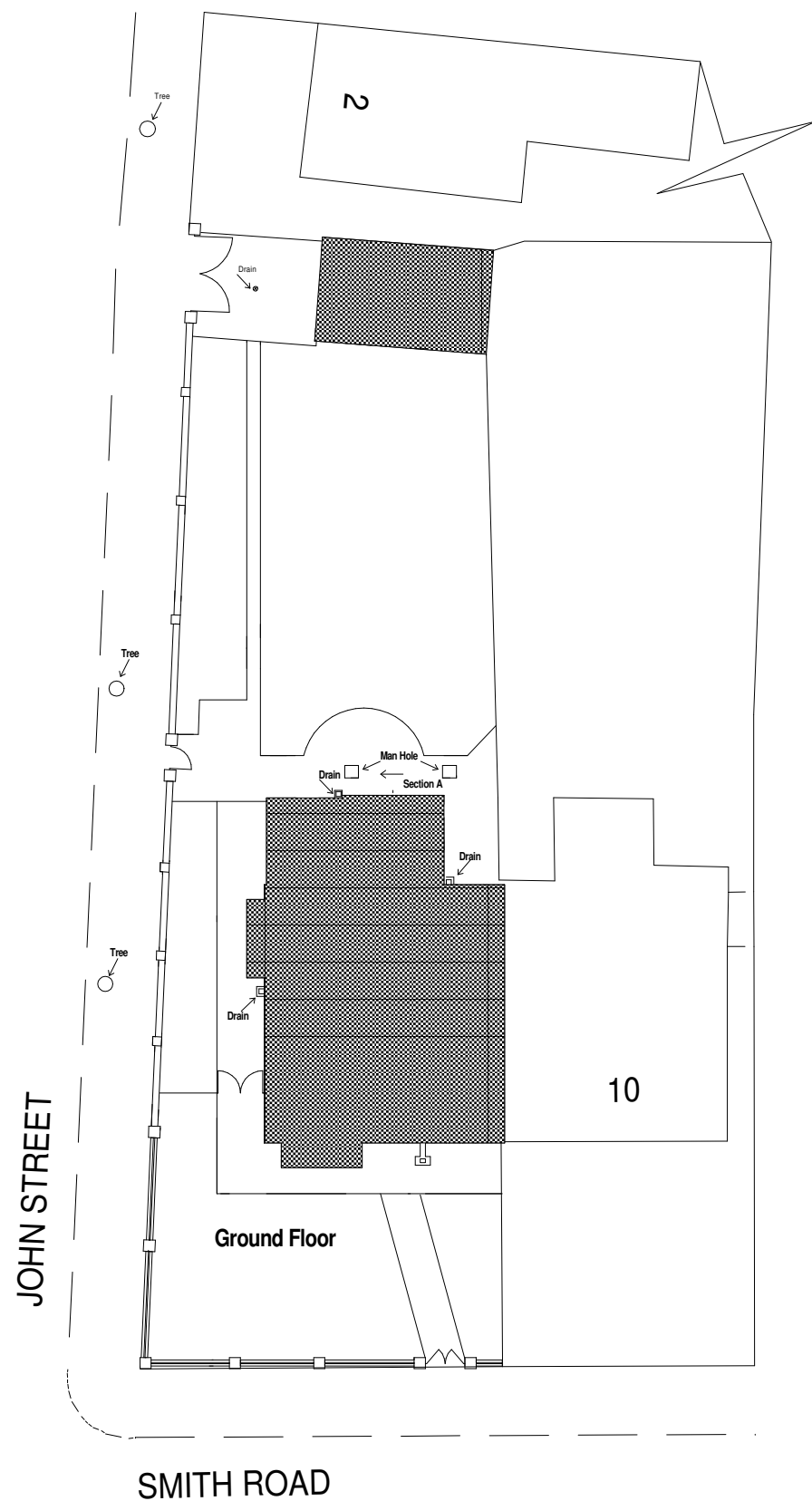
Detailed Site Plan