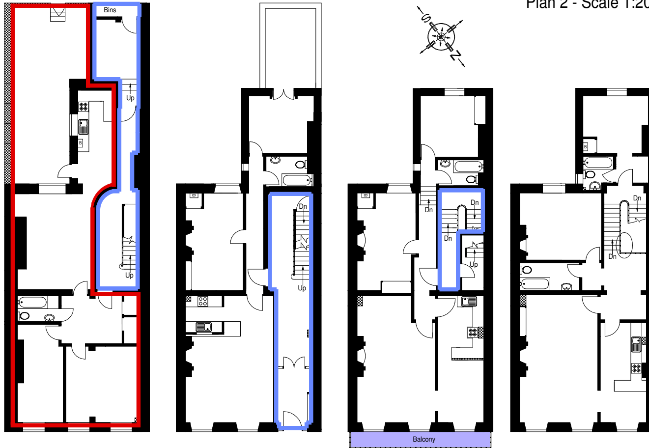
Lower Ground Floor Flat 1